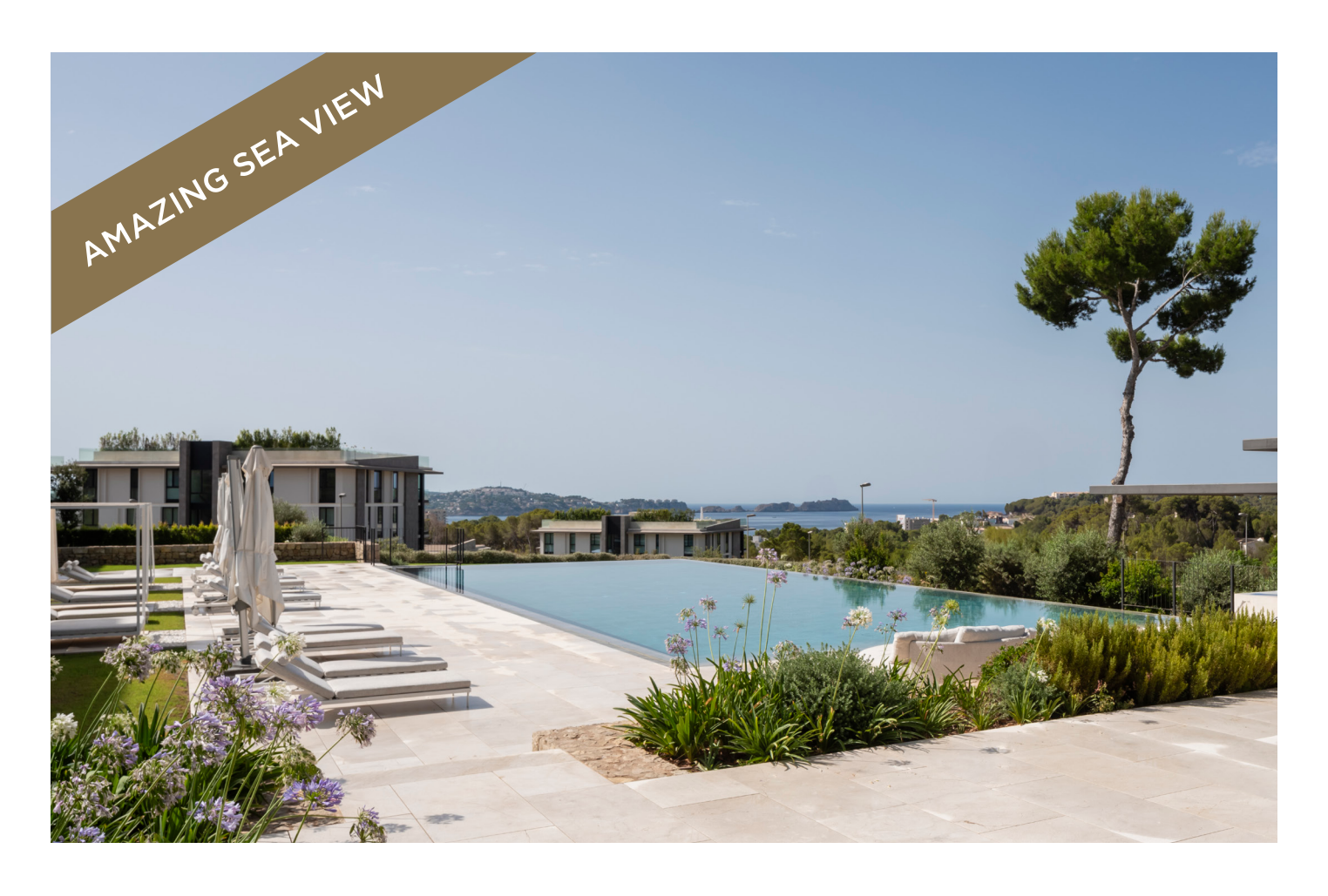
MAR 1 - PENTHOUSE WEST